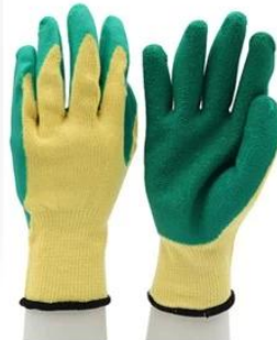
Safety Work Gloves